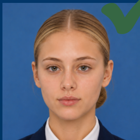
Minimal make-up, no eye make-up