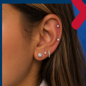
Multiple or facial piercings