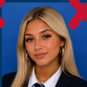
Jewellery (except approved religious symbols)