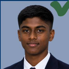
Short & tidy