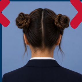
Unable to wear hat