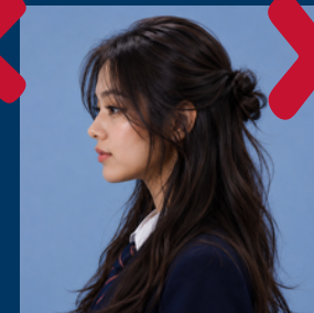
Not tied back