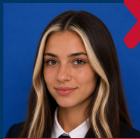
Unnatural streaks or highlights

Girls may wear light foundation only; no eye makeup or cosmetic enhancements are permitted. One small plain stud or sleeper in each earlobe is allowed. Boys may not wear piercings or embellishments.