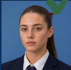
Navy, red, white or clear accessories