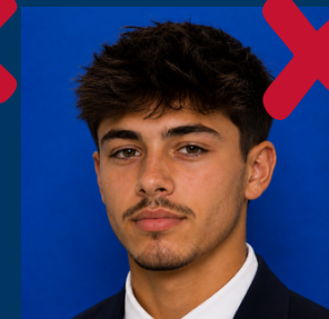
Facial hair. Must be clean shaven

Mascara, eyeliner, eyeshadow, lipstick, tinted lip gloss, blush, heavy foundation, and eyelash extensions are not permitted at any time. Facial piercings are strictly prohibited. Students may not wear large pearl earrings, thick or oversized hoops, gem or novelty-shaped earrings, necklaces, bracelets, rings, dangle earrings, helix piercings, or tragus piercings.