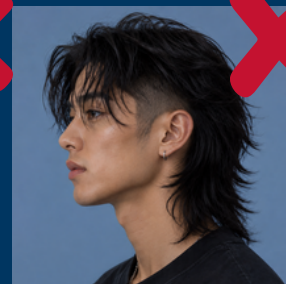
Extreme style cut