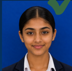
No hair product to allow for hat