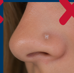
Clear plastic studs