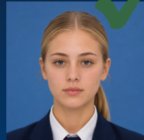
Consistent Natural Colouring