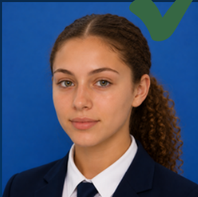
Natural colour bands