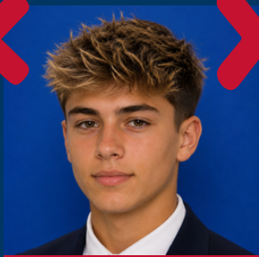
Unnatural tips, ombre or colours