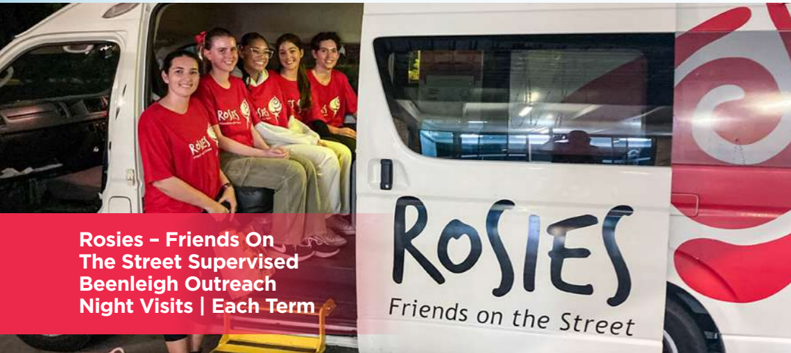
Rosies - Friends On The Street Supervised Beenleigh Outreach Night Visits | Each Term