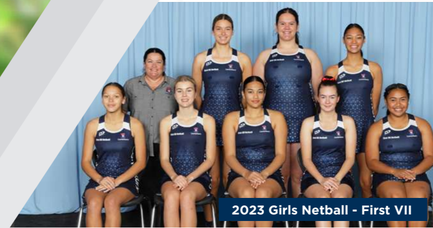
2023 Girls Netball - First VII