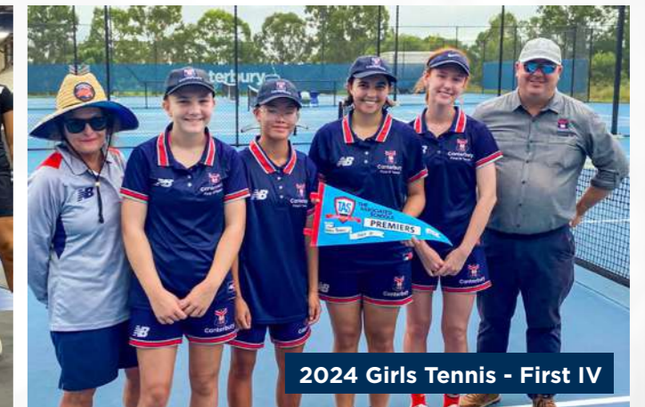
2024 Girls Tennis - First IV