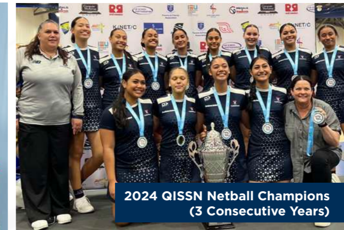
2024 QISSN Netball Champions (3 Consecutive Years)