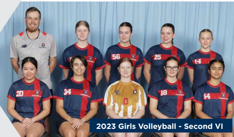
2023 Girls Volleyball - Second VI