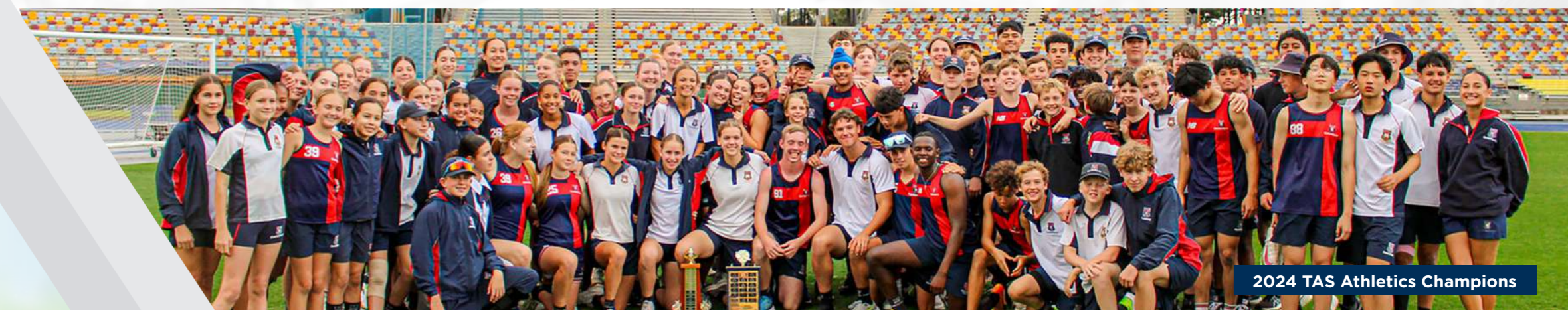
2024 TAS Athletics Champions

Other: QISSN Netball Champions 2024 (3 Consecutive Years), TAS Athletics Champions 2024