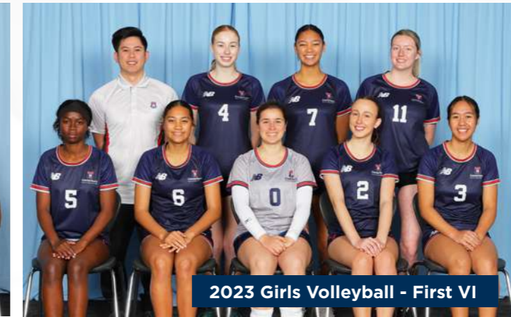
2023 Girls Volleyball - First VI