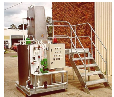
Carbon Dosing System

From skid-mounted equipment through to complete plants, Watertec is able to engineer, design and install as required. Watertec has a flexible Engineering team capable of designing, specifying and commissioning a range of systems. This team comprises project managers, mechanical, electrical, process and start-up engineers along with an AutoCAD drafting office. Depending on project requirements this team is supplemented with qualified and experienced engineering resources.