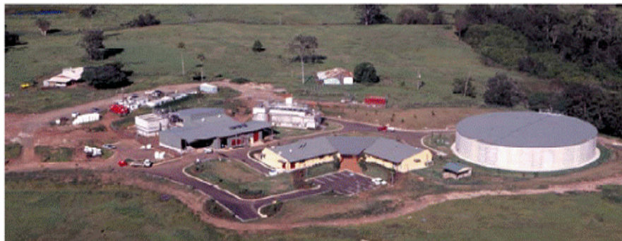
Water Re-Used WTP

Watertec Engineering is a world leader in providing innovative and quality water and wastewater treatment and disinfection solutions to communities and industry throughout the world. The Directors of Watertec Engineering have a combined knowledge and experience of more than 40 years in the water industry, and since 1988 Watertec has been designing, installing, operating and maintaining systems for the treatment, purification, disinfection, desalination, reuse and analysis of water