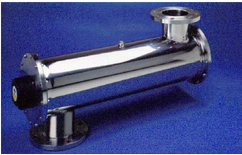
Ozgen UV System

Watertec is able to provide a range of Medium Pressure UV System from 100 m 3 /hr to 1000 m 3 /hr